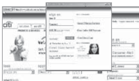
Figure 1: Spoofed pop-up with phony login visually on top of a real site.

real (since they see a valid lock symbol and address on the trusted site), and they enter their personal information in the pop-up (see Figure 1). By design, pop-ups do not need to show a lock symbol or address bar which could help users spot this scam (this is a compelling reason to never enter such data in a pop-up